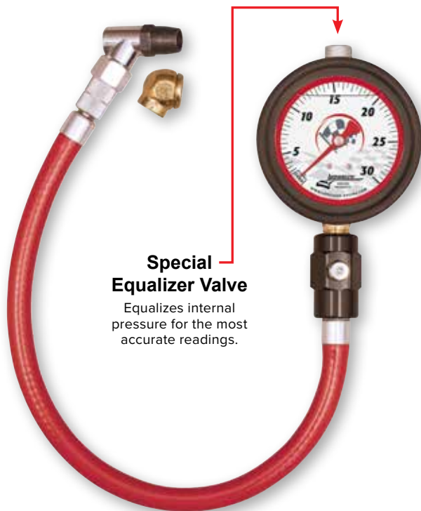
Special Equalizer Valve Equalizes internal pressure for the most accurate readings.

SCAN THIS QR CODE TO SEE OUR VIDEO TUTORIAL ON: HOW TO CHANGE YOUR GAUGE CHUCK AND GAUGE HEAD