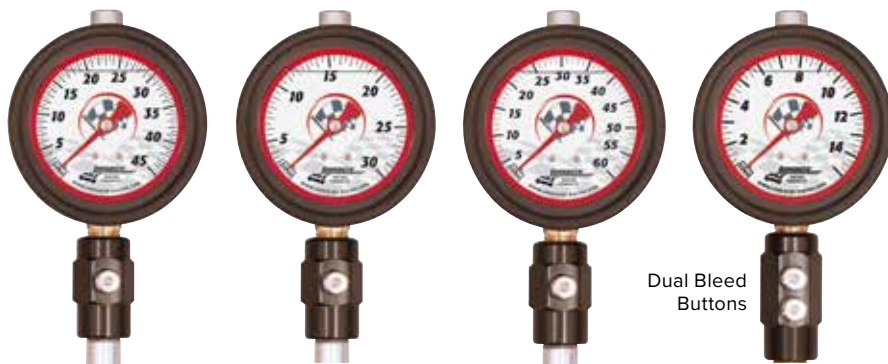
Dual Bleed Buttons