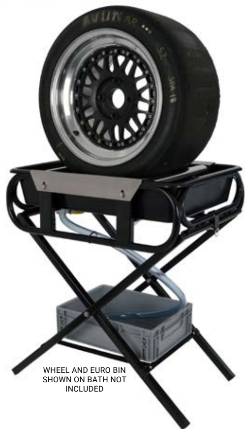
WHEEL AND EURO BIN SHOWN ON BATH NOT INCLUDED

A 400mm x 300mm Euro Bin can be fitted on the supports between the legs for storing your cleaning equipment and consumables.