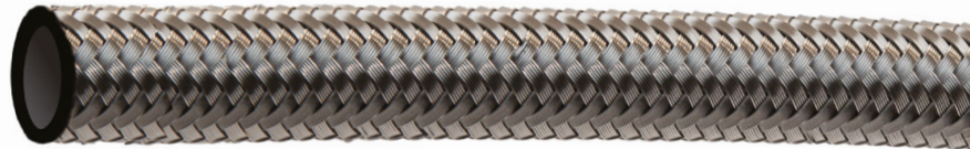
Data in this table is for the hose only

Compatible with reusable and crimp fittings. (Specialist equipment required).